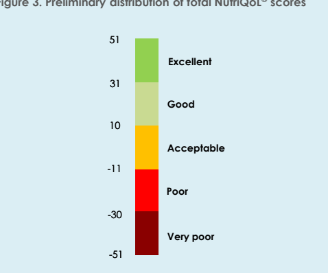
Figure 3. Preliminary distribution of total NutriQoL® scores