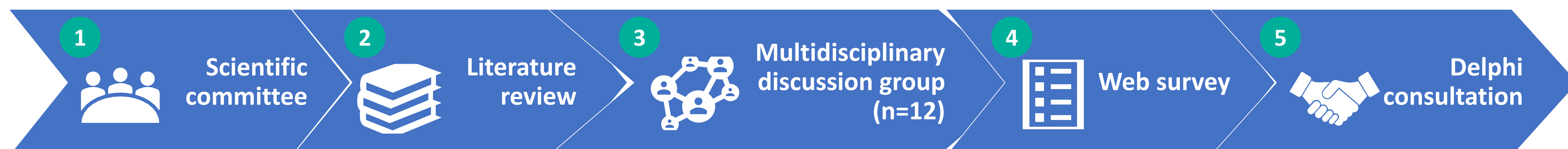
Figure 1. Delphi consensus development