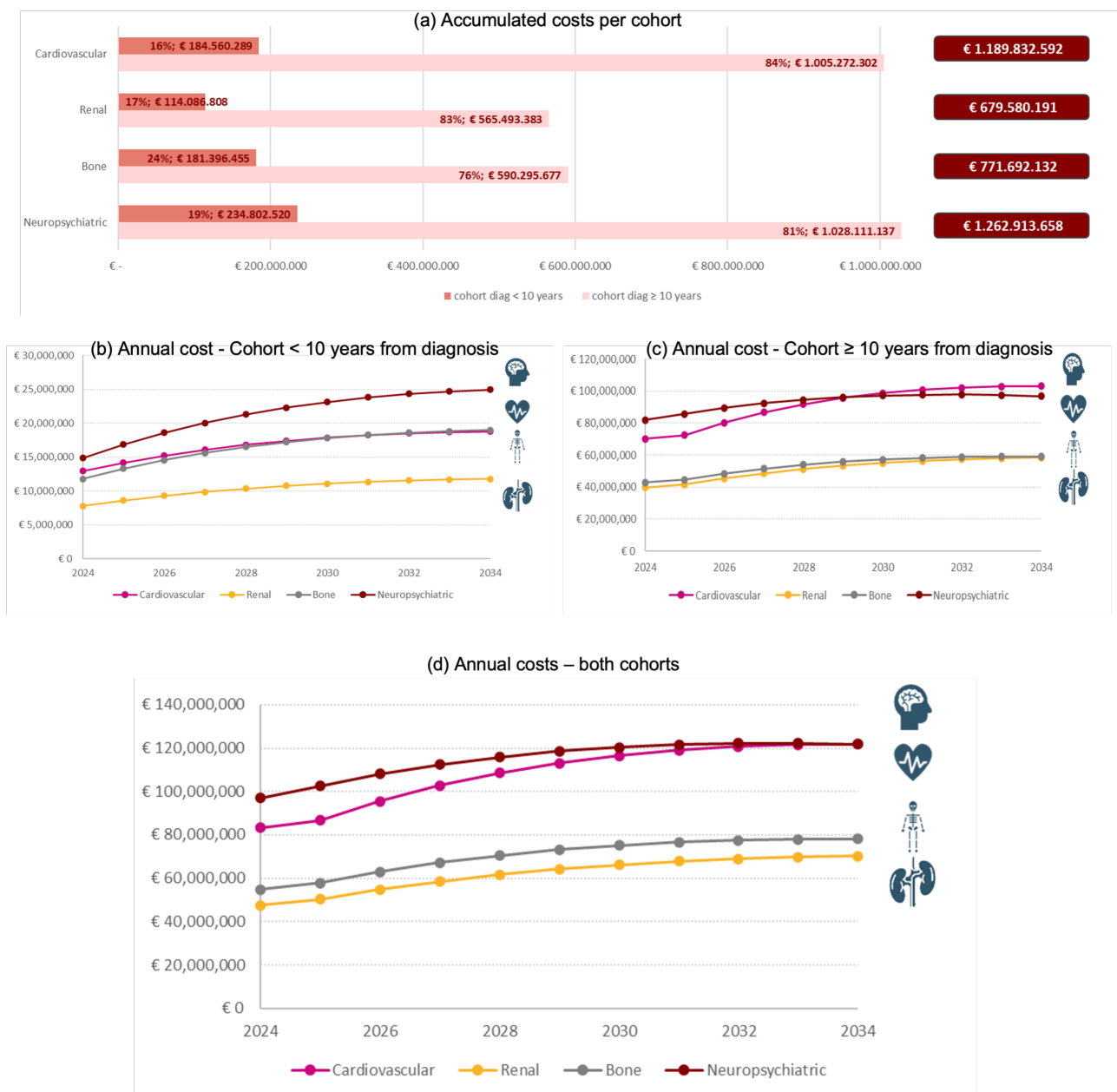
Figure 1. Total Costs (2024-2034)

number of patients affected by bone comorbidities, increasing from 17700 to 33950, and those with neuropsychiatric issues, rising from 16207 to 27388, over the same period. These increases were more pronounced among patients diagnosed with HIV ≥10 years ago, highlighting the cumulative effect of long-term HIV infection and treatment. As can be observed, despite the constant decrease in PLWH throughout